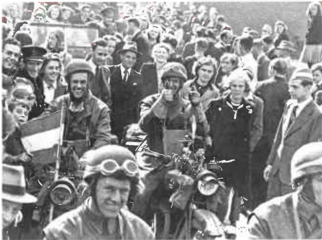
British dispatch riders are welcomed by the inhabitants of Eindhoven. They are all wearing a Dispatch Rider Helmet.