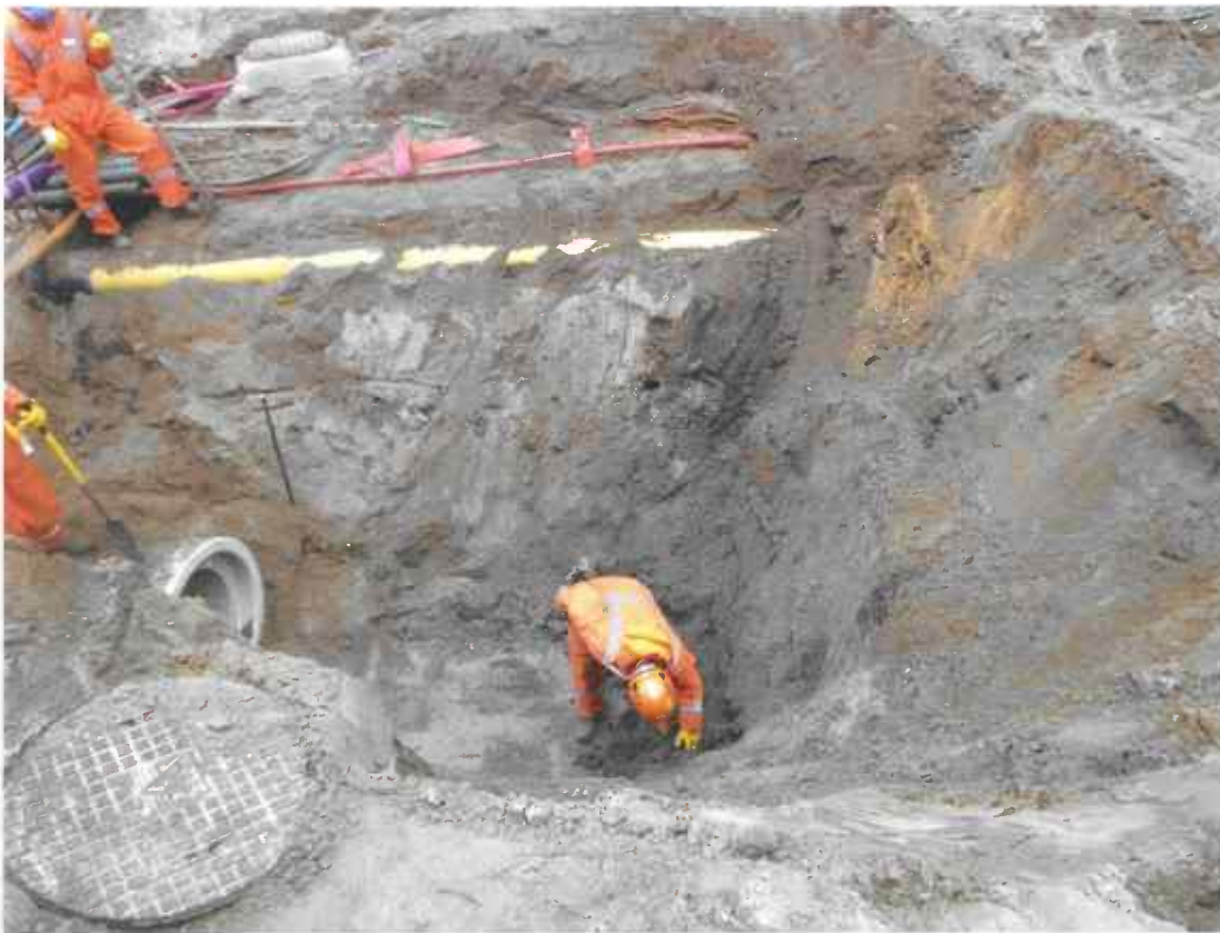
Overview of the groundwork near Stratumseind

We, here in Eindhoven, like to look to the future but we don't lose sight of our past. That is the reason for archeological research. There are archeological remains to be found from various periods of the history of our town. Some of these form our military heritage and much of that is from World War II (1940-1945). Military heritage sources play an important role in providing information about the lives of local inhabitants and military personnel and how they survived the war years. By combining information from the written word, pictorial sources and archeological finds, a more complete and varied picture emerges of this dark period in our recent past.