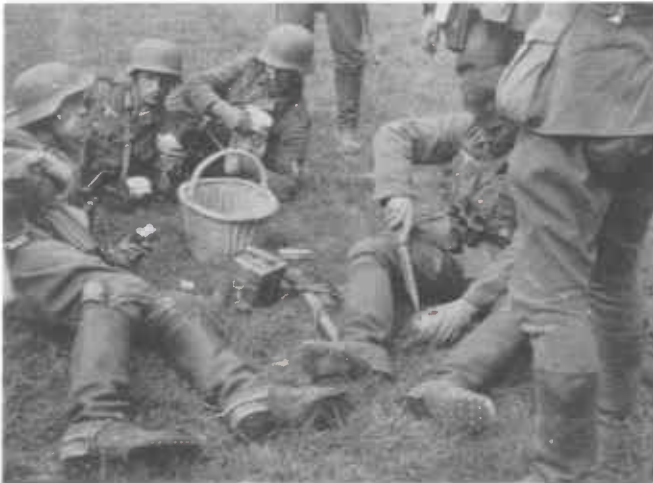
Additional text: German soldiers wearing model 35 steel helmets taking a break in a field sometime in May 1940.