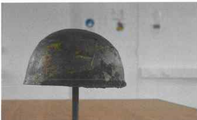
The British helmet, after conservation