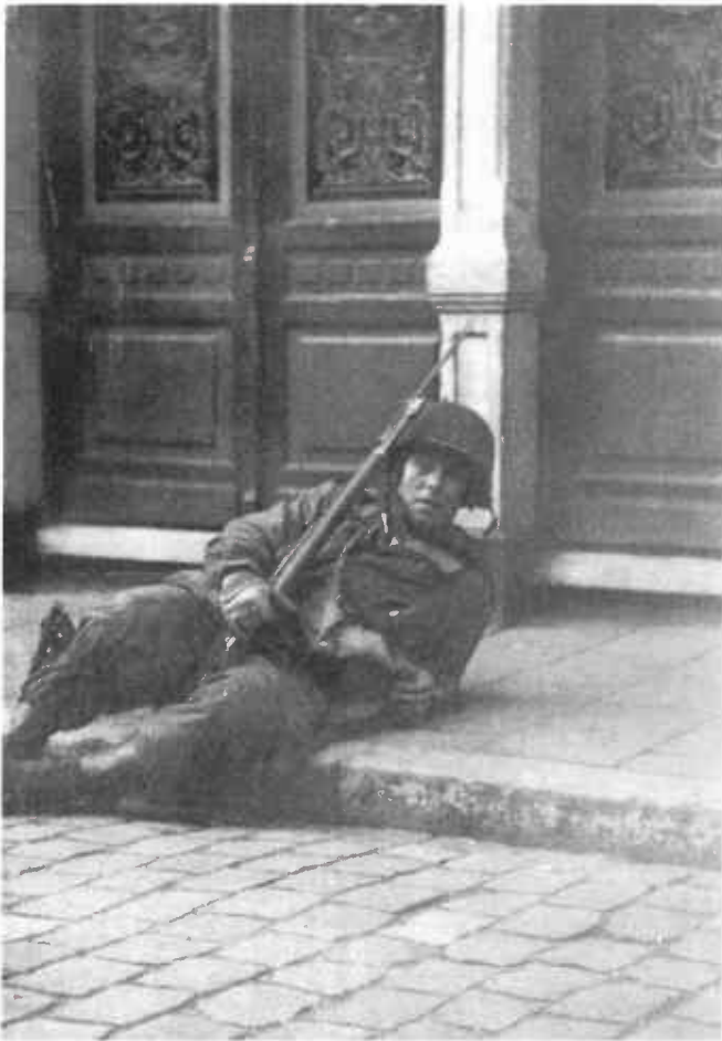
An American paratrooper of the 101st Airborne Division taking a break on Stratumseind, 18 September 1944.