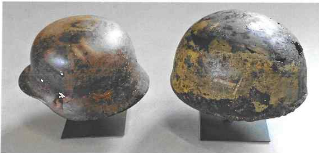
Left: the German helmet. On the right: the British helmet, after conservation.

out to be British and the other one German. The piece of shrapnel was from a shell from a 25 pounder gun. These finds ended up in the old moat near to the bridge at the end of a road leading out of town, Stratumseind. The moat was back filled in 1953 so these objects must have gone into the moat between 1944 and 1953.