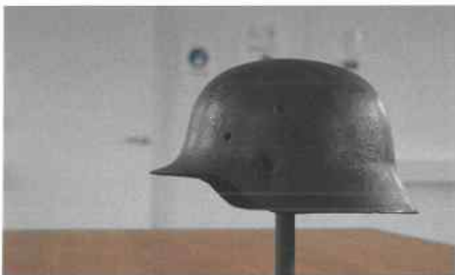
The German helmet, after conservation. The impact hole can be seen at the bottom.