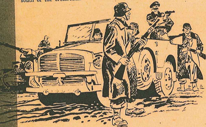
The German officer in the car stood up and took deliberate aim with a pistol.

These Germans had earlier captured some other Americans, among them five MPs, two ambulance drivers, a mess sergeant, several Medical Corps men, engineers, infantrymen and some members of an armored reconnaissance outfit. All the prisoners—there were about 150—were herded up the road where they were searched and stripped of their pocketbooks, watches, gloves, cigarettes and weapons. Their captors ordered them to line up in a snow-covered field south of the crossroads.