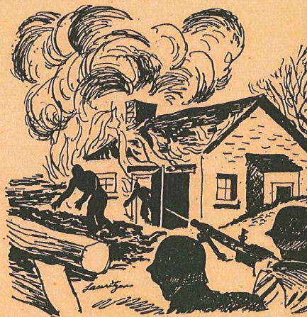
The burning building was covered by German guns

medy. Most of the Germans in the particular company involved are believed to have been killed in the recent battle against American forces in eastern Belgium.