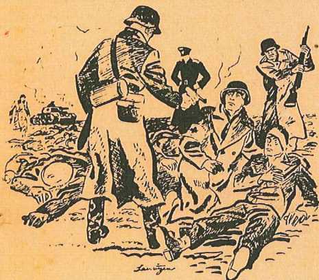
They shot both the medic and his wounded patient.

Questioning of the German PWs, together with the description of SS uniforms and insignia supplied by the Americans, has convinced First Army officials that members of the SS Panzer Division are responsible for the atrocity at Mal-